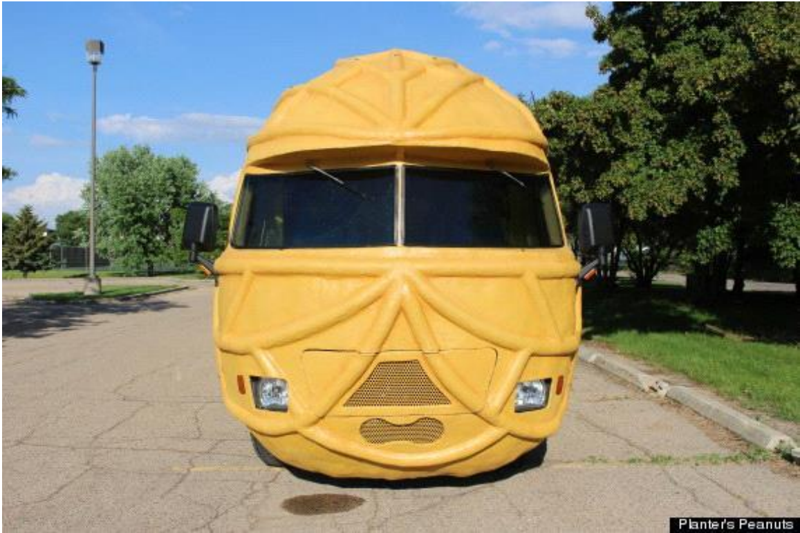
An earlier, smaller NUTmobile was built in 2011.