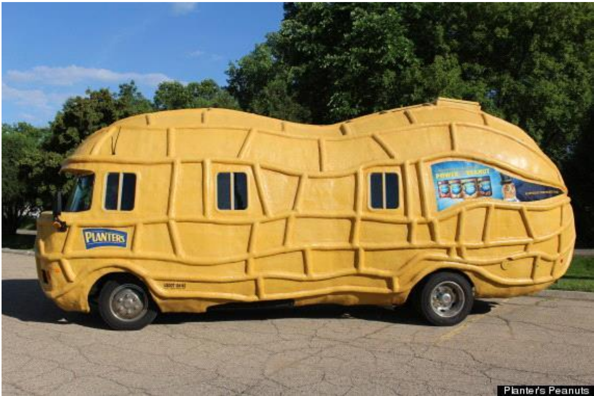
The new NUTmobiles are 27 feet long, hold between 25-30 gallons of diesel fuel and get about the same mileage as a large SUV. The one built in 2011 is only a measly 24 feet long.